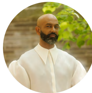
Brendan Fernandes Creative Voice Award