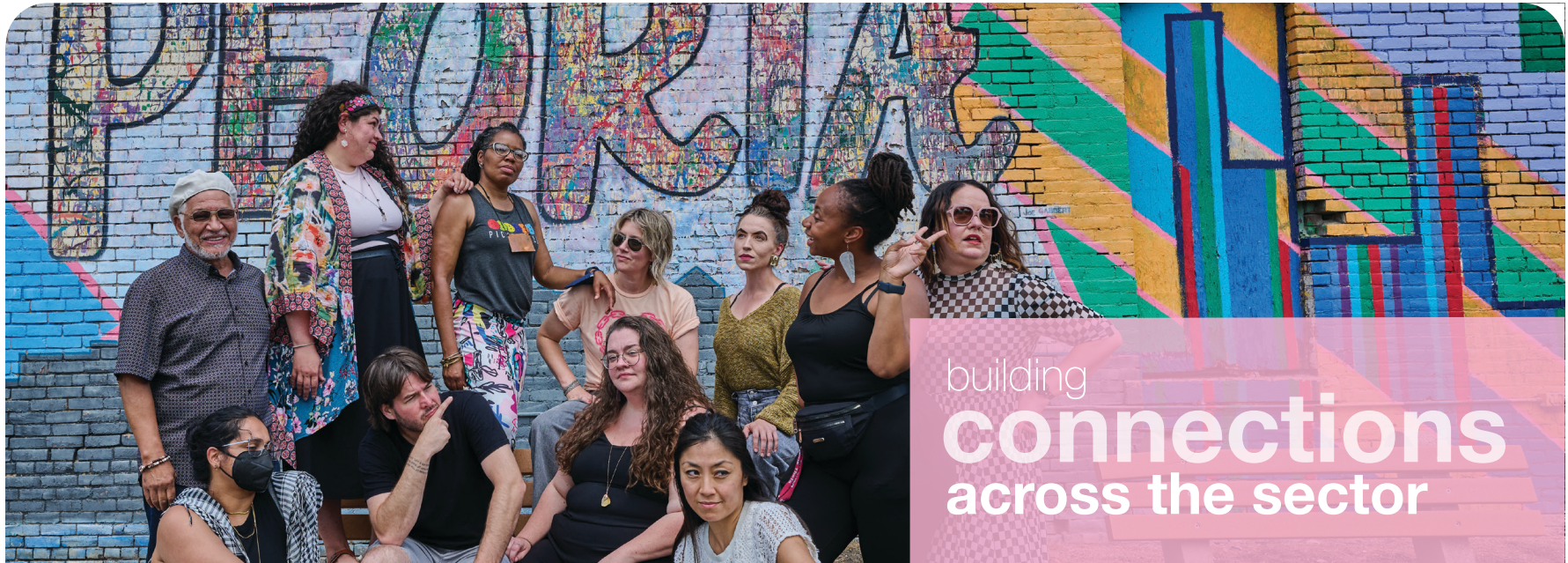
Arts Alliance's Liberation Learning cohort together in Peoria in summer 2024.