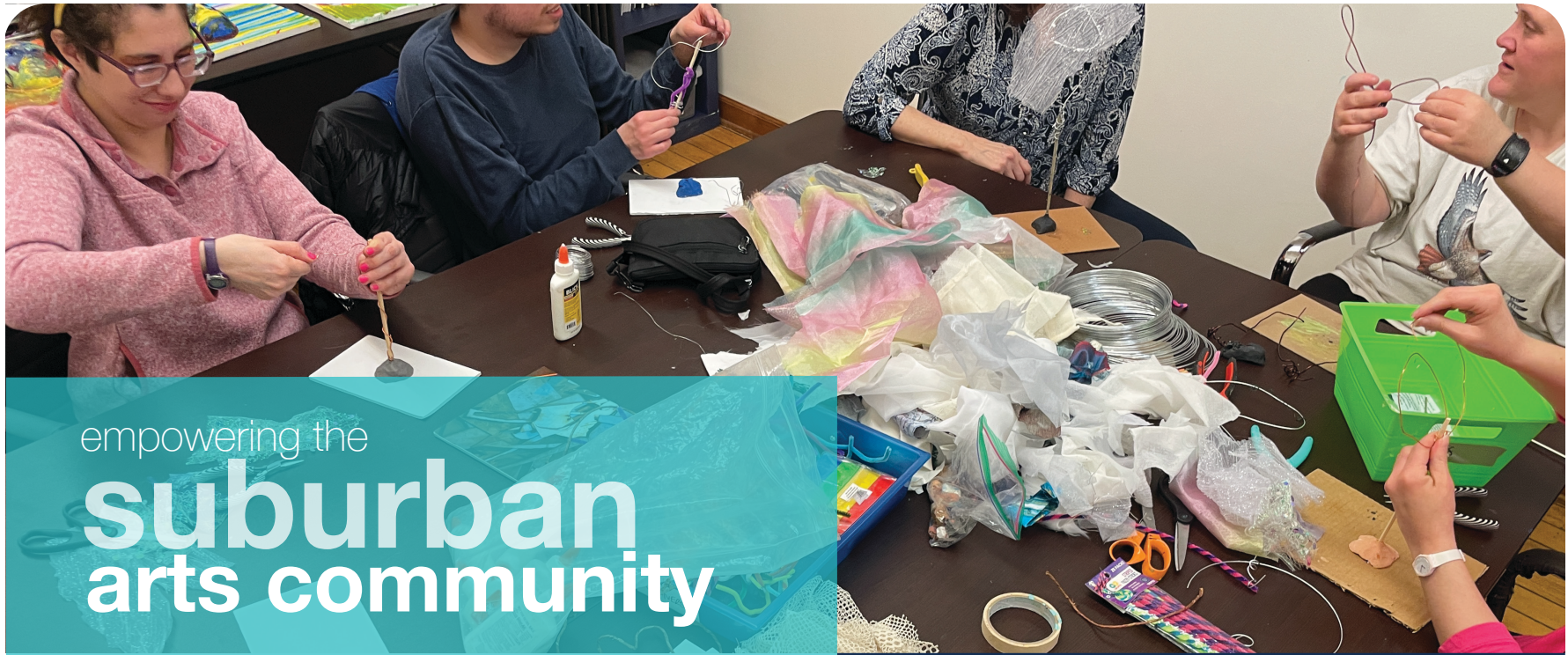
Cook County Arts Nonprofit Relief grantee, Art Encounter, hosts a workshop.